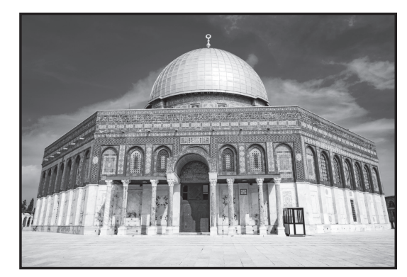
The Dome of the Rock

Many Jews suffered persecution and genocide, most notably in Germany during World War II. The term ghetto originally referred to the area of a city where Jews were required to live, but eventually came to mean a low-class area of a city where people lack opportunity.