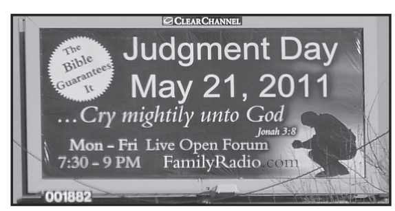
A Failed Prophecy<sup>3</sup>

The Time is at Hand (Jehovah's Witness publication)