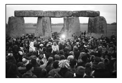
Stonehenge, an ancient stone monument in England, is the site of various religious activities.

The New Age religion has a variety of groups, organizations, and individuals. New Age followers are not united under a certain name or statement of beliefs. Some seem very religious, and others seem to be scientific instead of religious. They would not all say that they are part of a New Age religion, but they all share certain characteristics.<sup>33</sup>