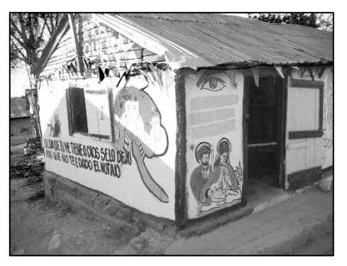
A witch doctor's office

Priests and priestesses in the religion lead worship events and can be hired to do sorcery or protect from sorcery. They may have a congregation that they lead in worship regularly and provide with other spiritual services. There are other sorcerers called bokor who may or may not be priests, and are more associated with evil sorcery. For example, a bokor can be hired to put a curse on someone.<sup>35</sup>